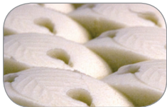
All-Natural Latex Foam Cushioning