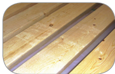
Solid Wood Slat Box Foundation

Affordable, high-quality sleep systems free from harmful chemicals—for the whole family.