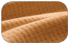
All-Natural Organic Stretch Cotton Cover