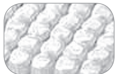
Independent, Flexible Pocketed Steel Coils