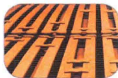
Flexible, Adjustable Slat Suspension Base