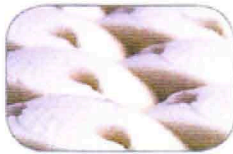
All-Natural Latex Cushioning