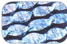
Independent, Flexible Carbon Steel Coils