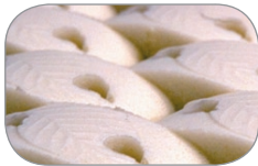
All-Natural Latex Foam Cushioning