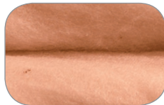
All-Natural Wool Liner For Breathability