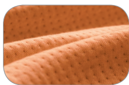
All-Natural Organic Stretch Cotton Cover