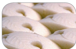
All-Natural Latex Foam Cushioning