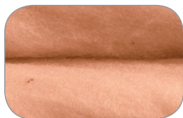
All-Natural Wool Liner For Breathability